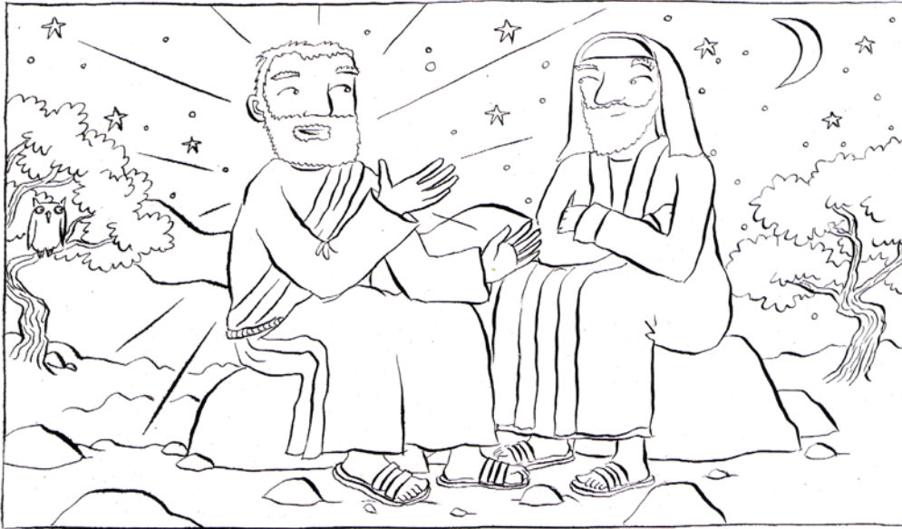
Nicodemus learns about the light from Jesus.

God sent Jesus into the world to save it and wants us to live in his light.