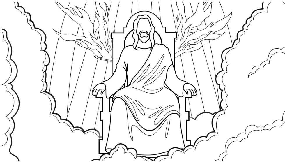
Daniel's vision is strong and powerful.

Daniel has a vision of a throne room in heaven where God promises an everlasting kingdom.