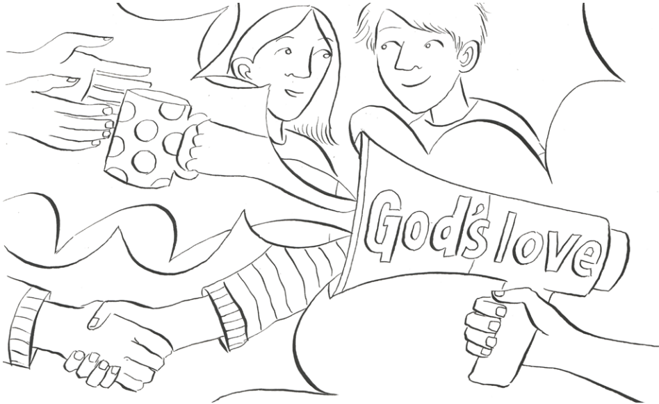
We can show God's love through our actions.

We need to know what's important to God and then to put it into action.