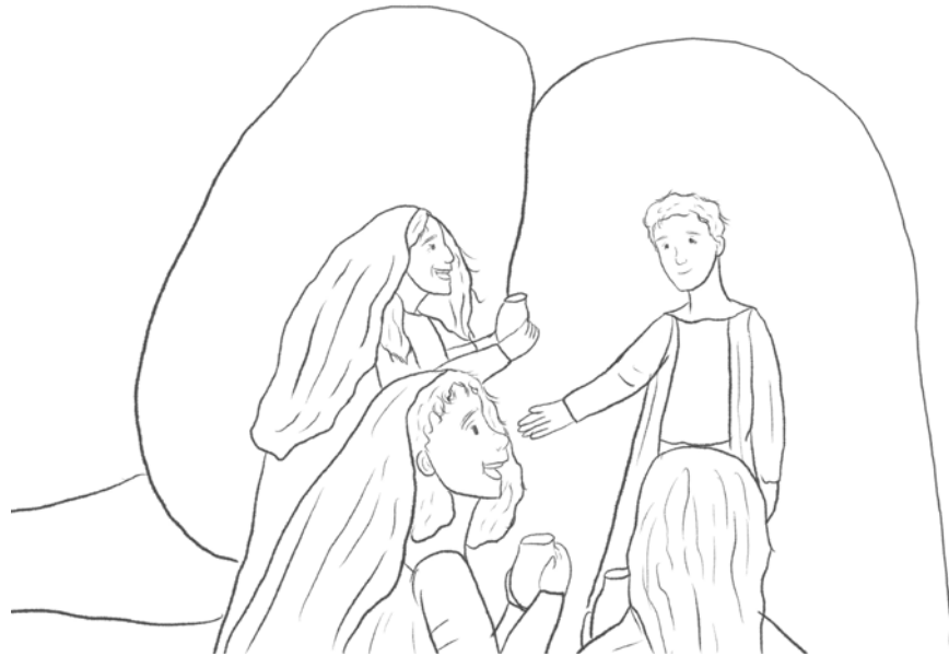
The angel tells the women that Jesus is alive!